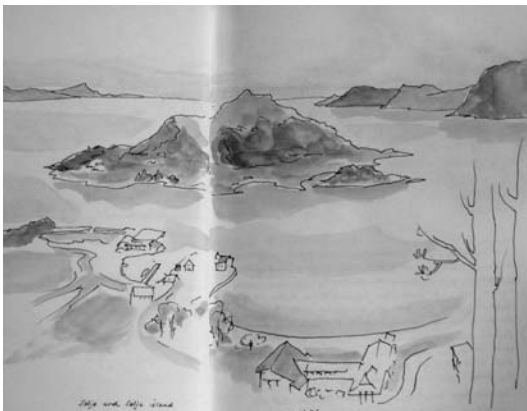
View of Selje, Norway from above the hotel. EGS Long Excursion June 2015. Sketch © Alison Kerr.