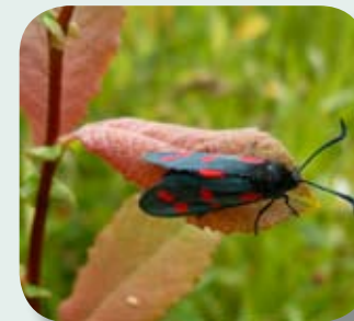
Six Spotted Burnet Moth

FAUNA: A variety of butterflies and moths can be observed including ringlet, common blue, meadow brown, small tortoiseshell, red admiral and peacock which are present in good numbers. The six spot burnet which is coloured black and red is a day flying moth that can be seen during the summer.