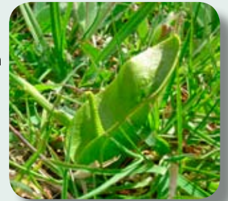
Adder's Tongue Fern

FLORA: The combination of high humidity and limestone is locally rare. The reserve supports lime-loving mosses and liverworts of regional importance. The regionally scarce Adder's Tongue Fern, can be found in good numbers in the northern meadow in May - early June. The well-drained higher ground hosts a herb-rich grassland with species such as twayblade, fairy flax,