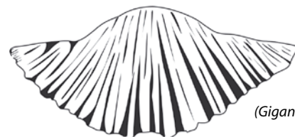
Brachiopod Shell ( Gigantoproductus giganteus )

sponges, crinoids (sea lilies), bivalves nautiloid molluscs, trilobites, gastropods (sea snails) and brachiopods. These species thrived in the shallow, tropical, clear-water marine environment that existed on the floor of the ancient tropical sea situated in Central Scotland in Early Carboniferous times.