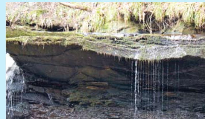
Upper Carboniferous mudstone in Gore Glen, it is interbedded with sandstones along the river.

About 65 million years ago, America started moving away from Europe, initiating the Atlantic Ocean. This formed the Mid-Atlantic Ridge. It caused large scale volcanism, forming some of the Western Isles of Scotland, such as parts of Rum, Mull and Skye. Scotland is no longer moving north but the Atlantic Ocean is still opening, with America moving away from Scotland at a rate of 2.5cm per year. The volcanism is concentrated along the Mid-Atlantic Ridge, where new crust is still forming under the ocean and in some places, creating islands like Iceland.