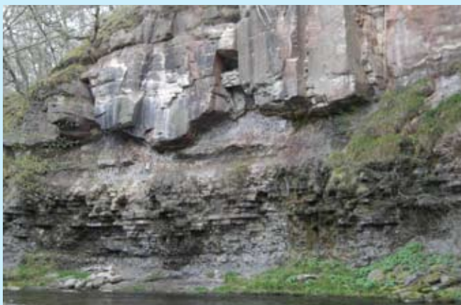
The base of ancient river channels in Carboniferous sandstone in Roslin Glen, by the Gunpowder Mill, with finer horizontal beds underlying it.

small intrusions called sills and dykes can be seen, with examples between Carlops and the North Esk Reservoir. Faulting occurred in the area, and the major faults trend east-west.