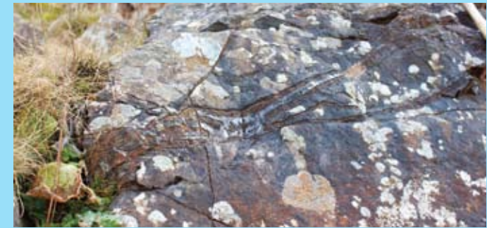
Veins in Devonian igneous rock in Carlops.

Fossils of sea creatures can be seen, such as brachiopods, gastropods, trilobites and fish. In places the sandstone contains igneous intrusions, which in turn are cut by veins made from hot fluids.