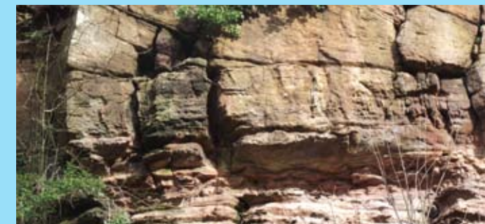
Sandstone in Auchendinny from the Early Carboniferous showing a boundary between two different sets of sandstone layers deposited by river currents. The upper set shows cross-bedding, where sand is deposited at an angle by moving sand ripples.

The Pentland Hills comprise volcanic and sedimentary rocks from the Devonian period. Studies elsewhere show that Scotland was still located south of the equator. The environment was hilly, volcanic and semiarid. It was a time of seasonal rainfall and poor, patchy vegetation cover. The uplands were being eroded, and sediment transported downhill to accumulate in sedimentary basins.