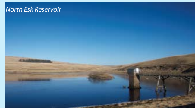
North Esk Reservoir

The North Esk Reservoir was constructed in 1850 to power the mills along the North Esk. However, the Rosebery and Gladhouse Reservoirs along the South Esk were built to provide freshwater to the Lothians.