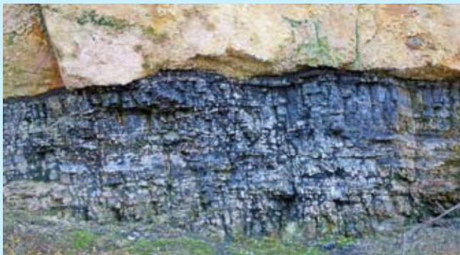
The coal seam in the Upper Carboniferous sandstones in Midlothian Coalfield under the A68.

The Carboniferous was a volcanically active time when Arthur's Seat Volcano formed, but in the Esk Valley only