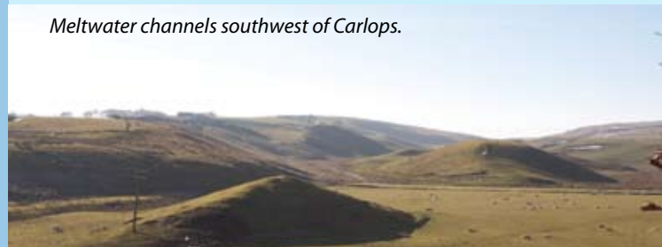
Meltwater channels southwest of Carlops.

The many mills along the River Esk are testament to the industrial use of the river. The use of the mills was extensive: gunpowder, paper, cotton, flour, flax and iron. Paper mills were by far the most abundant. The last mill closed in 2004.