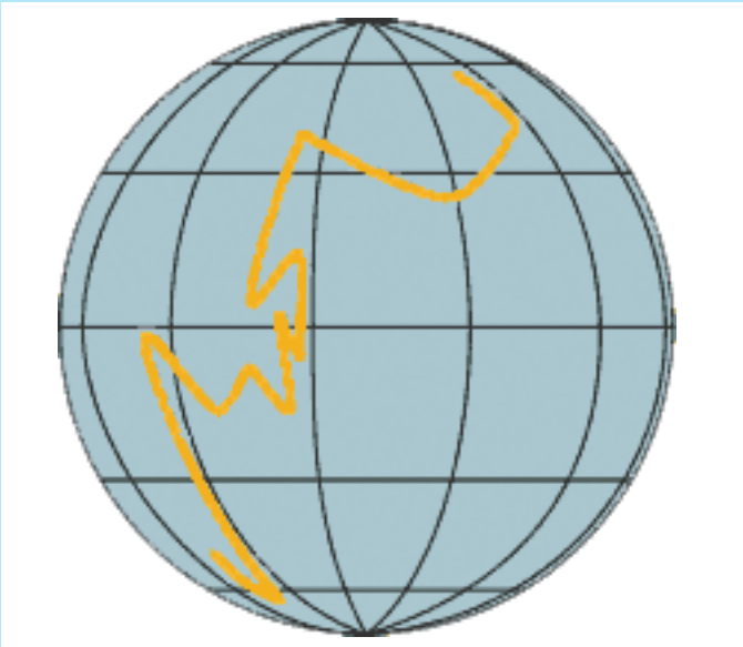
The globe shows Scotland's journey from south of the equator to the northern hemisphere.

Over the last 600 million years, Scotland has progressively moved northwards from south of the equator to its present position in the northern hemisphere today. Along the way, the rocks of Scotland and England, originally on different continents, joined together. The rocks reveal this history.