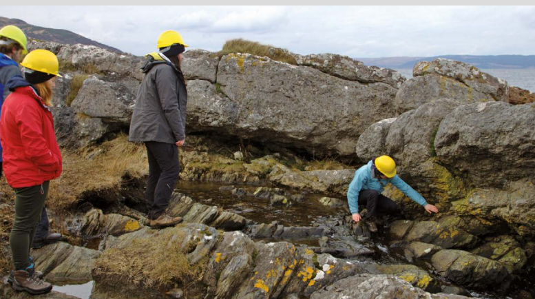
Students explore Hutton's Unconformity on Arran.